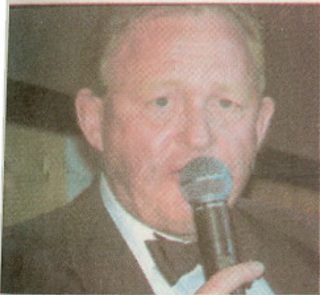
Master of Ceremonies