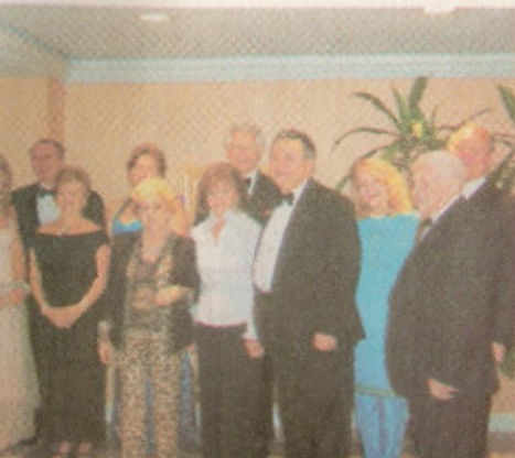
rd of Directors and Honorees