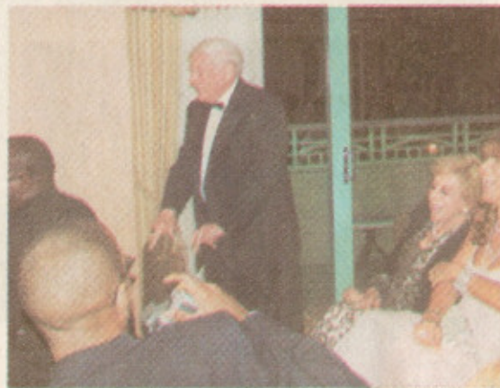
Post Event Media Conference